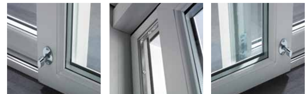
PatioMaster Secure is an optional extra to the standard range.