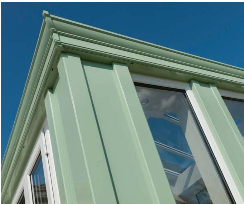
Cornice can be used with brick columns or with super insulated Loggia columns ▲

Change the visual dynamics externally too by using Cornice for a smooth finish at the wall/roof interface.