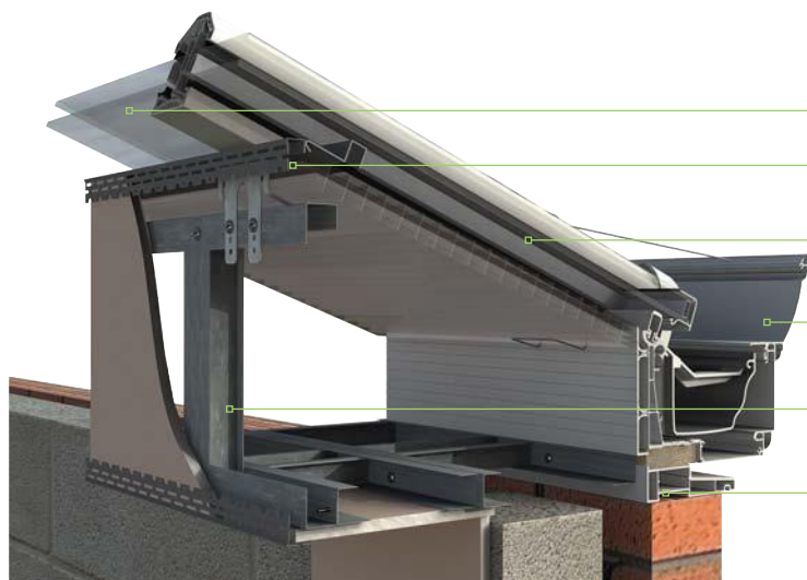
▲ Cornice and Liv in Room on brick columns

Liv in room uses an Ultraframe Classic glazed roof to which is attached a steel work ladder system at eaves and glazing bar positions. This is then plasterboarded and plaster skimmed to form a perimeter ceiling.