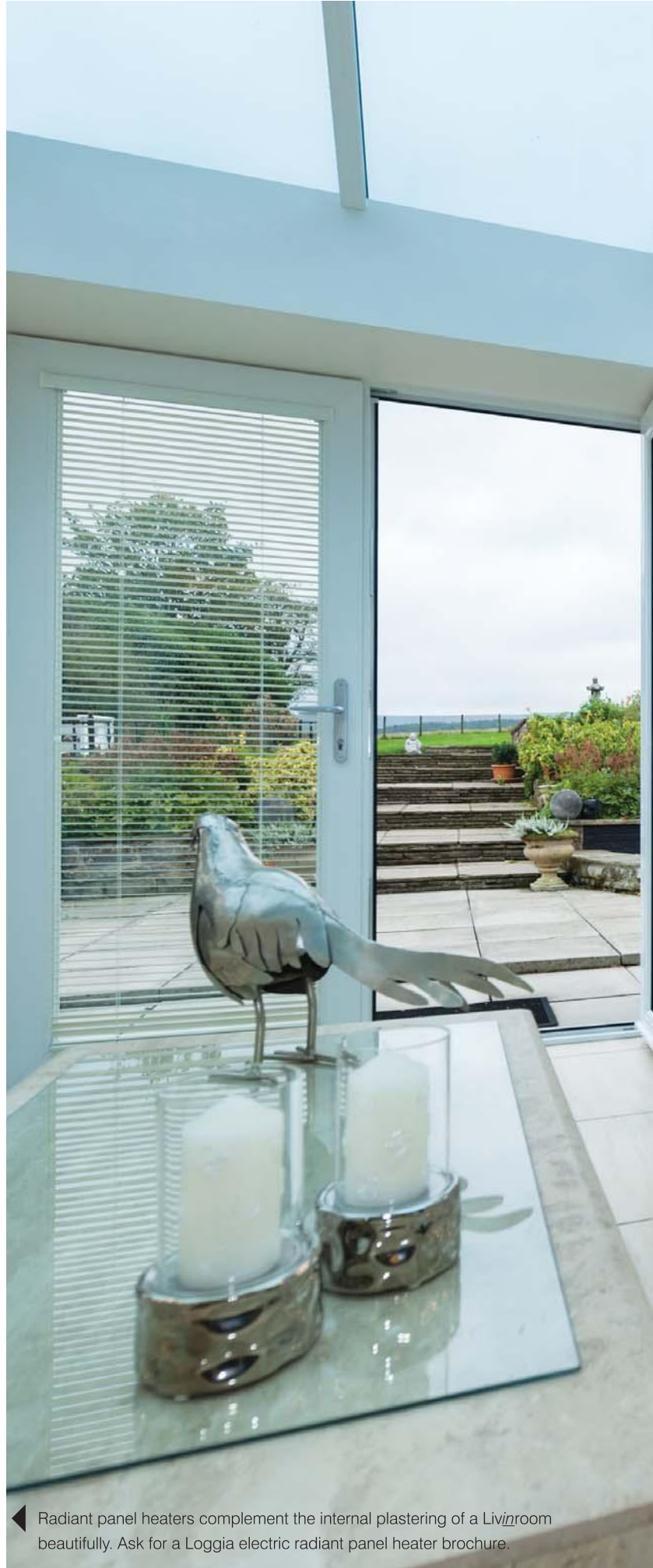
◀ Radiant panel heaters complement the internal plastering of a Living room beautifully. Ask for a Loggia electric radiant panel heater brochure.