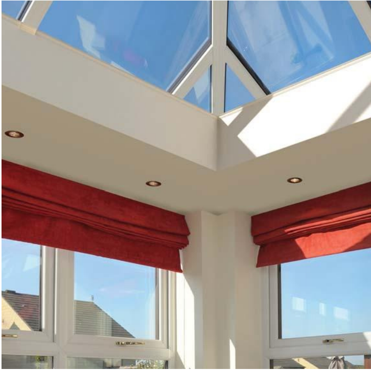
▲ Liv in room is perfect for downlighters or cable runs